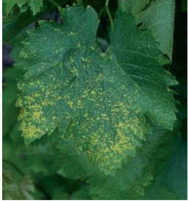
VIROID (Yellow speckle)